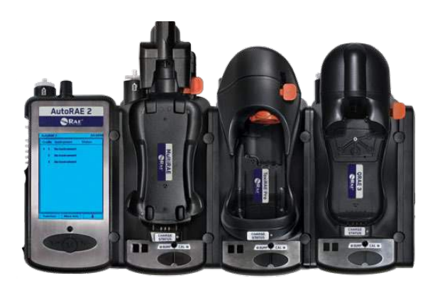
Quick and cost-effective calibration

The MicroRAE is not only user-friendly for workers; it's also userfriendly for safety managers. It's never been easier to optimize gas detection and safety administration with the features shown here.